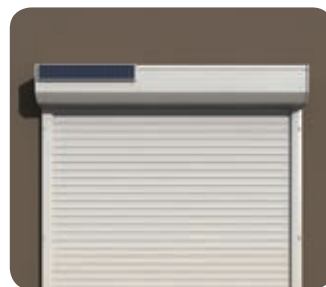
Solar Panel to Pelmet

The SolarSmart™ solar panels are an aluminium framed amorphous type which have excellent power output even in cloudy conditions, but must be directly exposed to sunlight in normal sunny conditions. They also have a better power output than most solar panels when affected by heat. North, east and west facing orientations require 1 solar panel. South facing orientations require 2 solar panels for optimum performance. The solar panels are supplied with 2 brackets which allow the panels to be attached flat to the pelmet or wall, or to the required angle to ensure maximum power performance. With all solar panel installations, all wires must be protected from UV radiation and the weather with all drill holes well sealed.