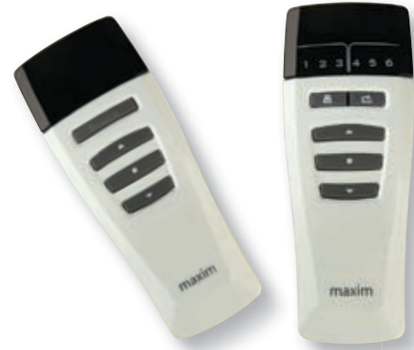
1 Channel Transmitter

The SolarSmart™ system incorporates the stylish Maxim Radio Transmitter and is available in both 1 Channel and 6 Channel options. Both transmitters are powered by a 3 Volt Lithium button battery.