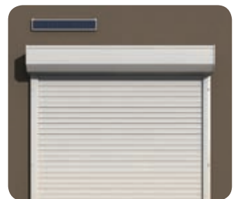
Solar Panel to Wall