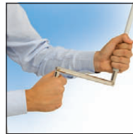
Crank Handle With Gear Ace (Up To 30Kg) See Page 43 For Universal Joint Position Options For Gear Ace Shutters