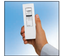
Remote Control With 240V Electric SIMU Hz Manual Override Motor