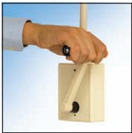
Steel Cable Winder (Up To 50Kg)