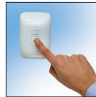
PowerSmart™ Control System With 12V Motor (Up To 50Kg)*