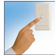
Wall Switch With 240V Electric Manual Override Motor