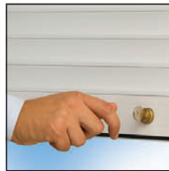
Spring Loaded With Key Lock