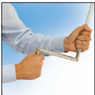
Crank Handle With 240V Electric Manual Override Motor

* When used in conjunction with an assist spring as per CW Products specifications.