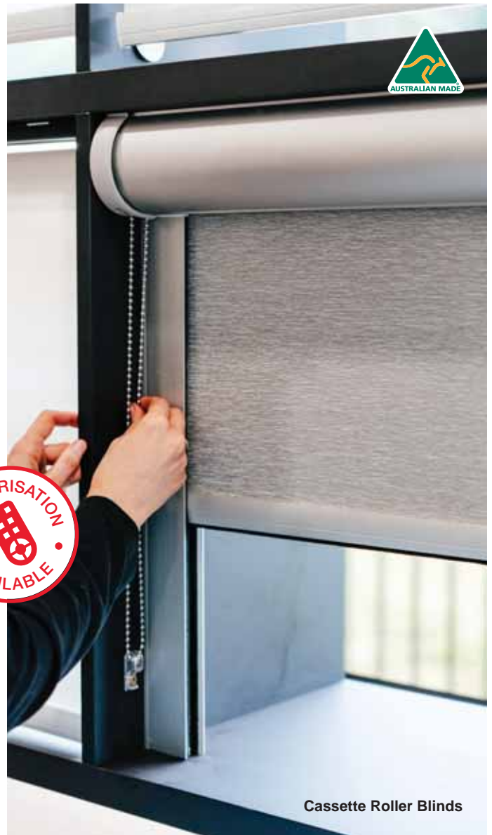
Cassette Roller Blinds