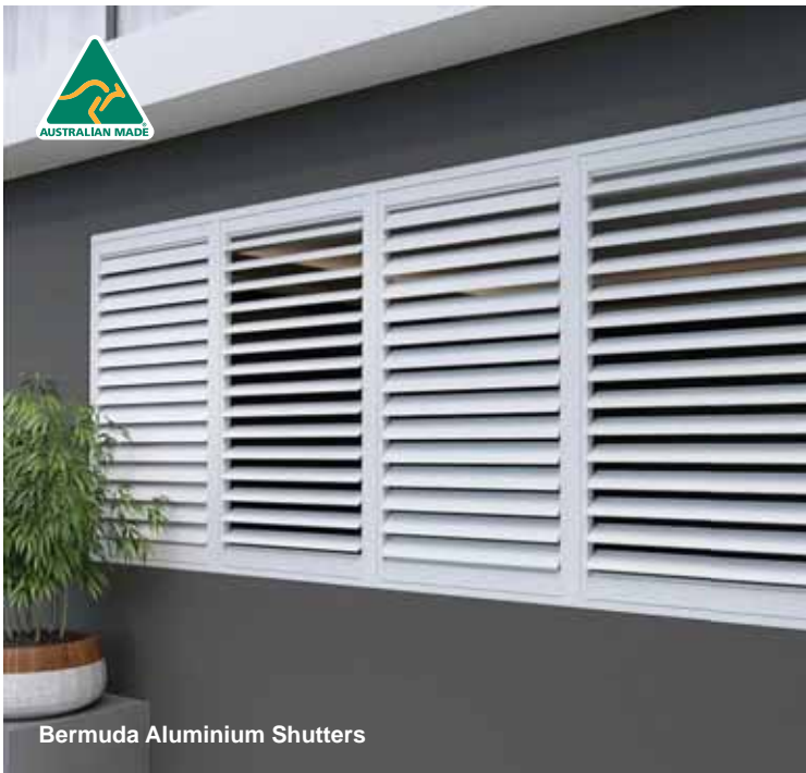
Bermuda Aluminium Shutters